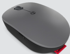
Lenovo Go USB-C Wireless Mouse PN: 4Y51C21216

Designed to complement the lifestyle of ultrabook users, the Lenovo Go USB-C Wireless Mouse is crafted for superior portability and comfort. With a blue optical sensor that works on most surfaces and USB-C connectivity, it is ready to thrive in a dynamic workplace. Its ultra-long battery life and programmable utility button ensure it is capable of any task and ready to be used at a moment's notice.