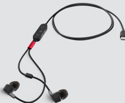
Lenovo Go USB-C ANC In-ear Headphones PN: 4XD1C99220

Designed to complement the lifestyle of ultrabook users, the Lenovo Go USB-C Wireless Mouse is crafted for superior portability and comfort. With a blue optical sensor that works on most surfaces and USB-C connectivity, it is ready to thrive in a dynamic workplace. Its ultra-long battery life and programmable utility button ensure it is capable of any task and ready to be used at a moment's notice.