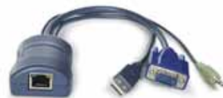
Example CAM: CATX-USB-A

Sun CAM: CATX-SUNA (Sun plus audio) Serial flash upgrade cable (4-way jack connector to 9-way D-type male serial connector): CAB-9DF-RJ9-2M