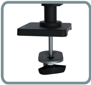
GROMMET MOUNT #98-728