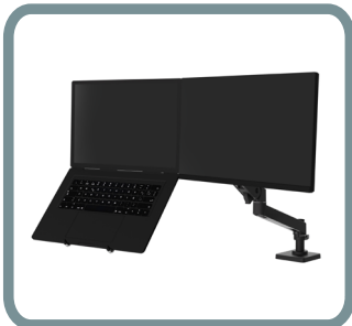
NOTEBOOK TRAY #50-193-200