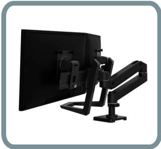
HANDLE KIT *ONLY FOR DUAL DIRECT #98-037