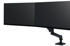
LX Pro Dual Direct