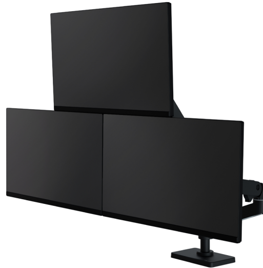
ADD AN ARM WITH THE DISPLAY ARM EXPANSION KIT (DUAL TO TRIPLE OR QUAD) *ONLY FOR LARGE BASE #98-734