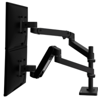
LX Pro Dual Stacking