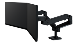
LX Pro Dual Side-By-Side