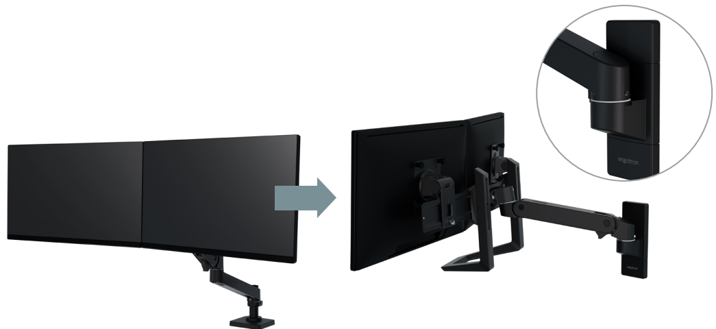
DESK-TO-WALL CONVERSION #98-730