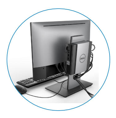
Actual product setup with cables