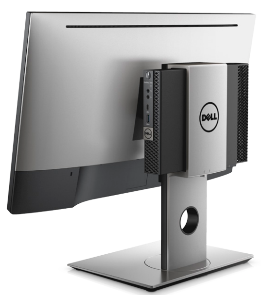
Shown with monitor and Micro desktop (not included).

Conveniently secure the stand to its Micro chassis with the Kensington lock slot and/or padlock slot. The meshed cable cover hides cables from view and prevents them from getting dislodged.