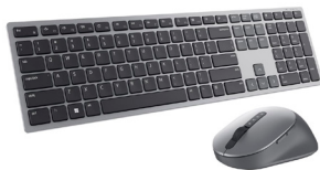
Dell Premier Wireless Keyboard and Mouse - KM7321W

Experience lightning fast charging and Thunderbolt™ 4 connectivity with this flexible and powerful modular dock.