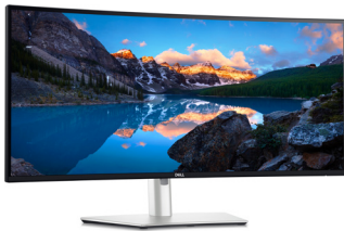
Dell UltraSharp 34 Curved Thunderbolt™ Hub Monitor - U3425WE

Create your ideal workspace with these recommended accessories.