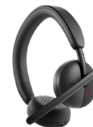
Dell Wireless Headset - WL3024

Designed for on-the-go productivity and protection, the Dell EcoLoop Pro Backpack 15 is made of eco-conscious material to complement busy lifestyles.