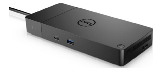
Dell Thunderbolt™ 4 Dock - WD22TB4

Stay focused on a 23.8-inch QHD monitor optimized to deliver high performance details and clarity.