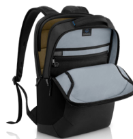
Dell EcoLoop Pro Backpack - CP5723

Experience superior multitasking features with a stylish and comfortable premium keyboard and mouse combo. Complete your tasks powered by one of the industry's leading battery lives at up to 36 months.*