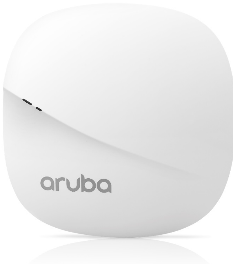
Aruba 303 Series Campus Access Points

The compact Aruba 303 Series AP delivers a maximum concurrent data rate of 867 Mbps in the 5GHz band and 300 Mbps in the 2.4GHz band (for an aggregate peak data rate of 1.2Gbps). Featuring 2x2:2SS, the Aruba 303 is designed for medium device density environments, such as schools, retail branches, warehouses, hotels and enterprise offices, where the environment is cost sensitive.