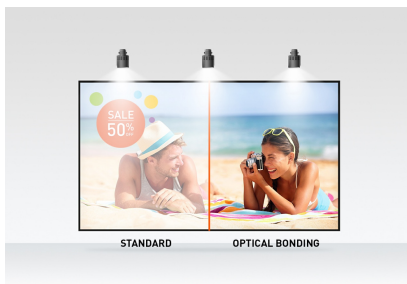
Optical bonded PCAP

Available also in white : ProLite T2752MSC-W1