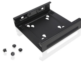
ThinkCentre® Tiny VESA Mount II