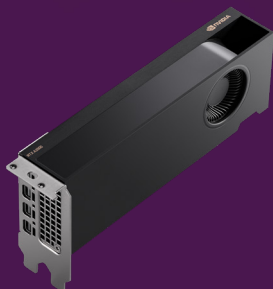
NVIDIA RTX™ A2000 Graphics Card 6