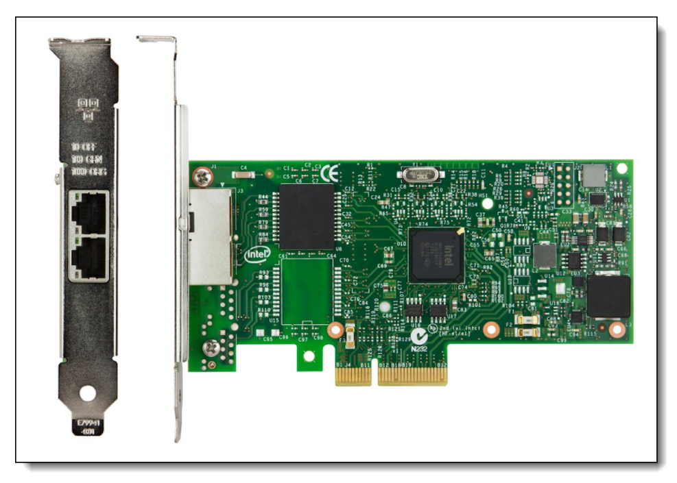
Figure 3. Intel I350-T2 2xGbE BaseT Adapter