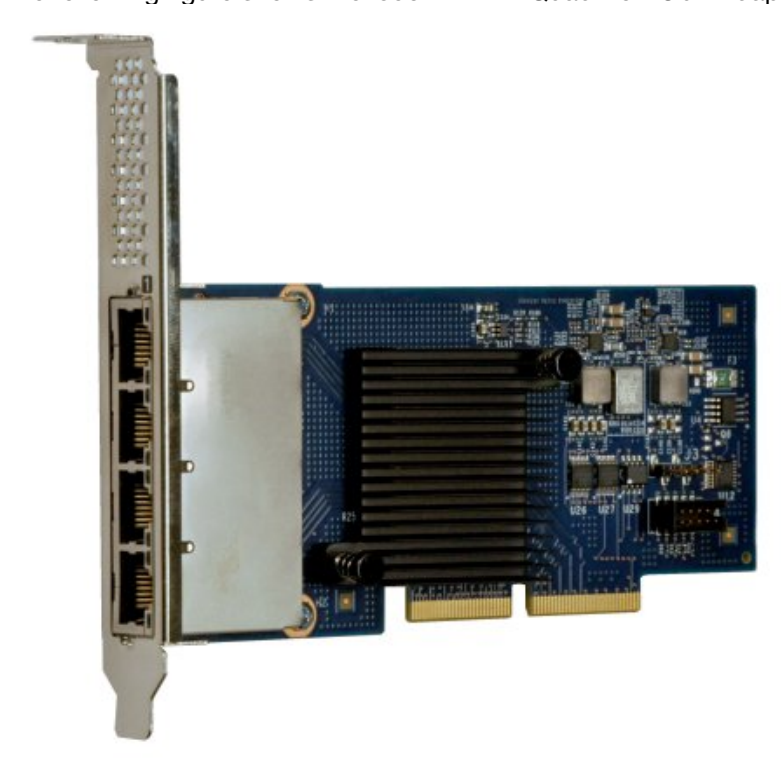
Figure 1. I350-T4 ML2 Quad Port GbE Adapter

The following figure shows the I350-T4 ML2 Quad Port GbE Adapter.