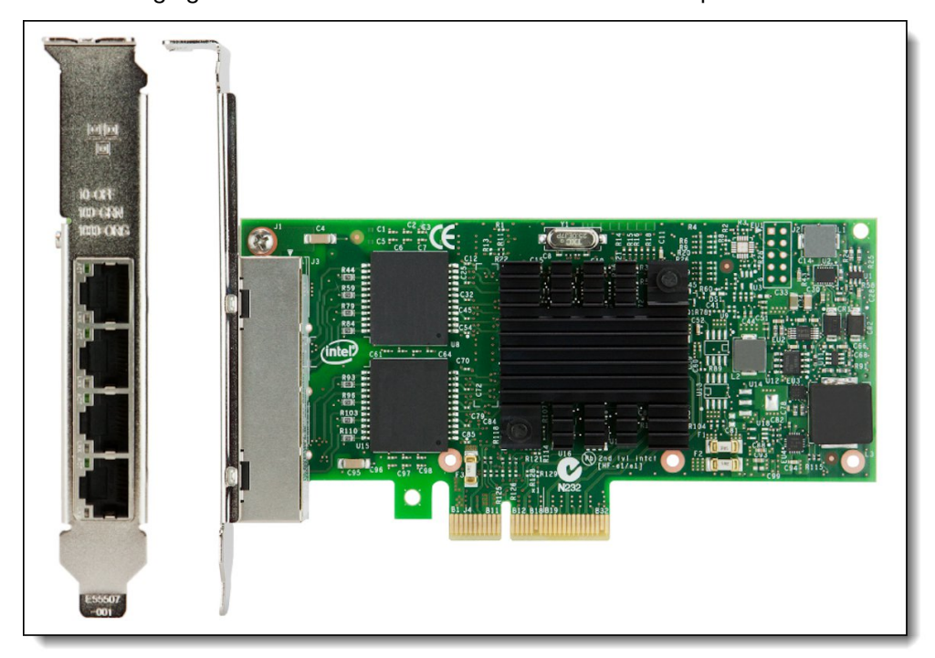
Figure 4. Intel I350-T4 4xGbE BaseT Adapter

The following figure shows the Intel I350-T4 4xGbE BaseT Adapter.