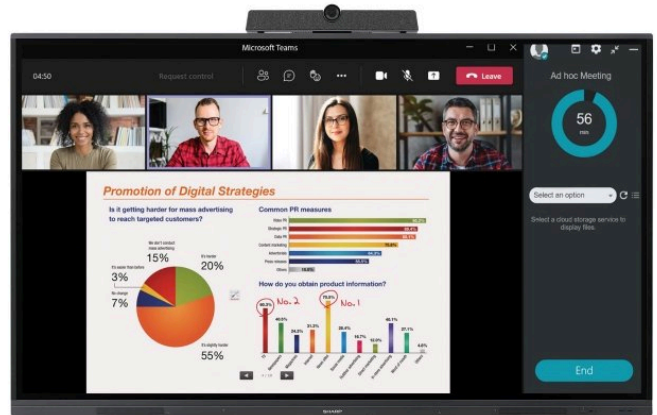
* AV Soundbar PN-ZCMS1 optional