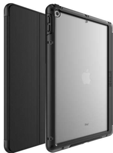
Starry Night 77-62045 660543503699