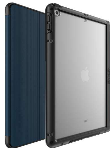
Coastal Evening 77-62047 660543503750