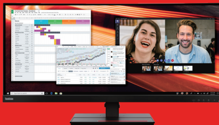
An eye – and ear – for detail

The P34w-20 kicks your work up a notch with outstanding visuals to show accurate colors from any angle. With WQHD 3440 x 1440 resolution, the monitor helps you capture even the smallest details while seeing true-to-life color with a 99% sRGB color calibration delta E<2. Designed to impress, the 2 x 3W built-in speakers offer immersive audio that is true to your ears. The P34w-20 is also created with your health and comfort in mind, with eye-care and Natural Low Blue Light technology to reduce harmful high energy blue light emissions. Adjust the monitor height up to 150 mm to suit your ideal working style or position. Meanwhile, Lenovo ThinkColour 2 software allows you to easily and quickly adjust your screen settings with a simple click to enhance your work efficiency and optimize your monitor's extensive capabilities. Lenovo patented features, such as LAN on ThinkColour, show the network status from the screen to facilitate a more seamless workflow.