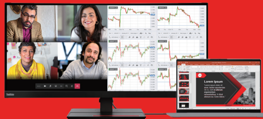
Master the art of multi-tasking

The P34w-20 kicks your work up a notch with outstanding visuals to show accurate colors from any angle. With WQHD 3440 x 1440 resolution, the monitor helps you capture even the smallest details while seeing true-to-life color with a 99% sRGB color calibration delta E<2. Designed to impress, the 2 x 3W built-in speakers offer immersive audio that is true to your ears. The P34w-20 is also created with your health and comfort in mind, with eye-care and Natural Low Blue Light technology to reduce harmful high energy blue light emissions. Adjust the monitor height up to 150 mm to suit your ideal working style or position. Meanwhile, Lenovo ThinkColour 2 software allows you to easily and quickly adjust your screen settings with a simple click to enhance your work efficiency and optimize your monitor's extensive capabilities. Lenovo patented features, such as LAN on ThinkColour, show the network status from the screen to facilitate a more seamless workflow.