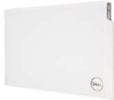
Dell Premier Sleeve - XPS 13 (white)