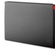
Dell Premier Sleeve - XPS 13