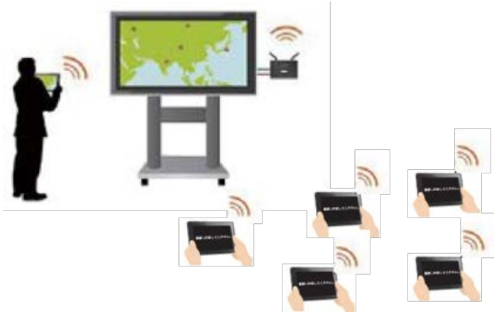
Real time wireless interactive collaboration between teacher and student including touch input and display.