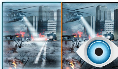
FLICKER FREE + BLUE LIGHT

With a height adjustable stand you will create an ergonomic work posture and position that meets all health and safety requirements. This will not only prevent any health issues but will also increase your productivity. The pivot function allows the screen to rotate from landscape to portrait orientation. This functionality can be useful if the application requires more height than width.