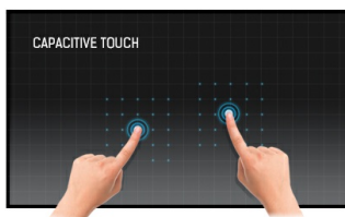
Touch technology - Capacitive

Equipped with a foam seal, the monitor supports seamless integration and the IP65 rating ensures dust and water resistance from the front. Portrait and landscape orientation ensures flexible mounting options for 24/7 operation in almost any installation. The TF3215MC-B2 is the ideal solution for kiosk integrators, industrial environments, control rooms and interactive multi-media applications.