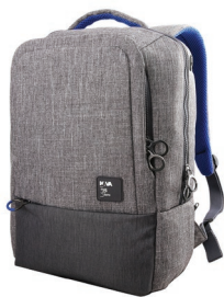
Lenovo On Trend Backpack