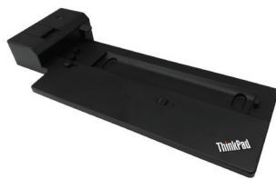
ThinkPad® Pro Docking Station