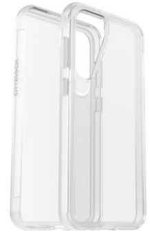
Clear 77-91194 (Retail) 840304713769 77-91195 (ProPack) 840304713776

* Helps protect the case exterior against many common bacteria. It does not protect you or the screen. Active ingredient: silver phosphate glass.