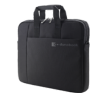
Laptop Case B116 (PX1880E-2NCA)