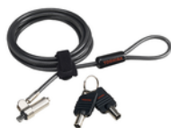
Ultra Slim Keyed Cable Lock (PA5364U-1KCL)