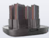
94ACC0192 4-slot Battery Charging Dock