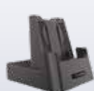
94A150095 Single Slot Charging Dock