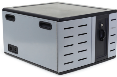
Zip12 Charging Desktop Cabinet