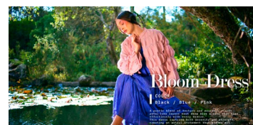
XR Processor with AI Scene Recognition further enhances contrast, delivering even greater visibility