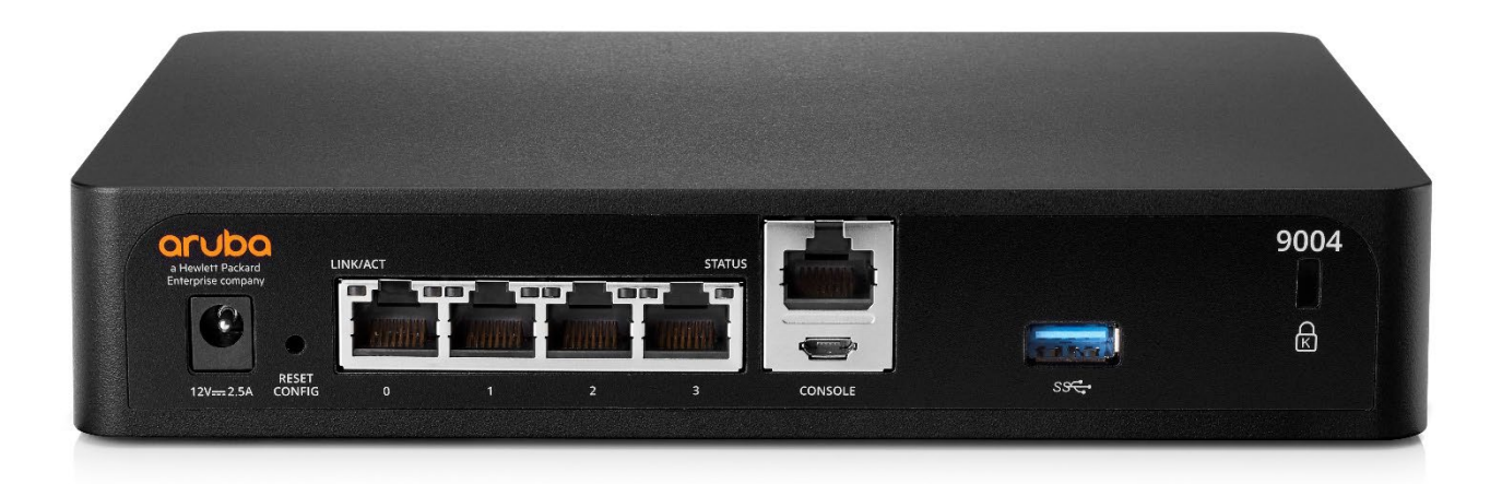
Aruba 9004 Gateway