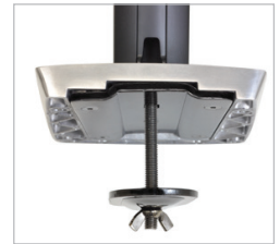
Grommet Accessory for WorkFit-A 97-692

© 2014 Ergotron, Inc. rev. 10/14/2014/EA Literature made in US Content is subject to change without notification