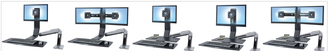
WorkFit-A, LCD LD