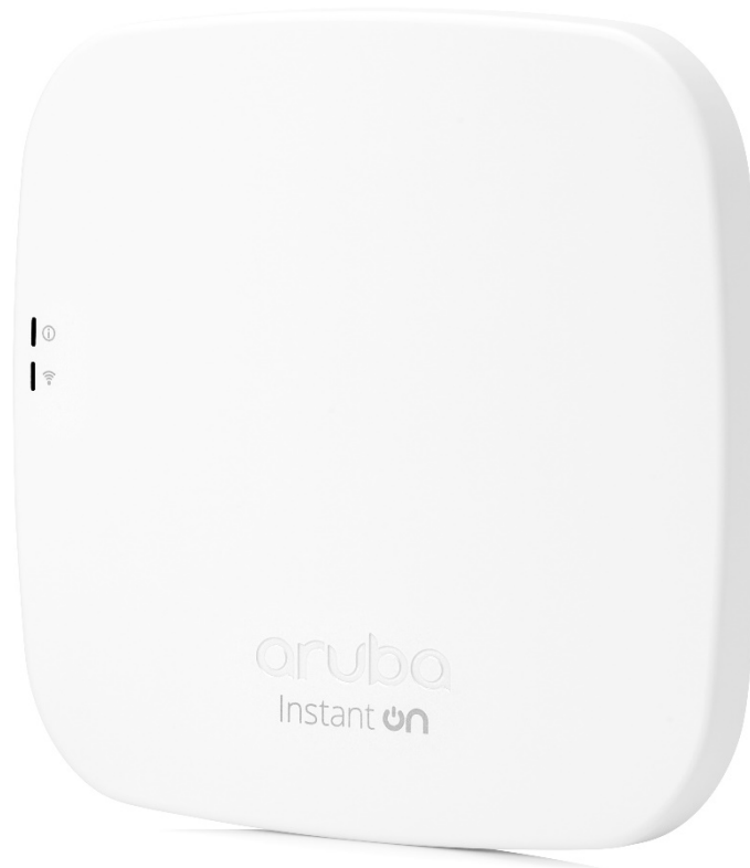
Aruba Instant On AP12 Indoor Access Points

Whether you own a café or a trendy boutique hotel, your employees and customers are relying on the network for almost everything they do. And because Wi-Fi plays such a crucial role today, you need a purpose-built solution that keeps your business on the go. Aruba Instant On Access Points (APs) are easy to deploy and manage—with a quality look and feel at an attractive price point.