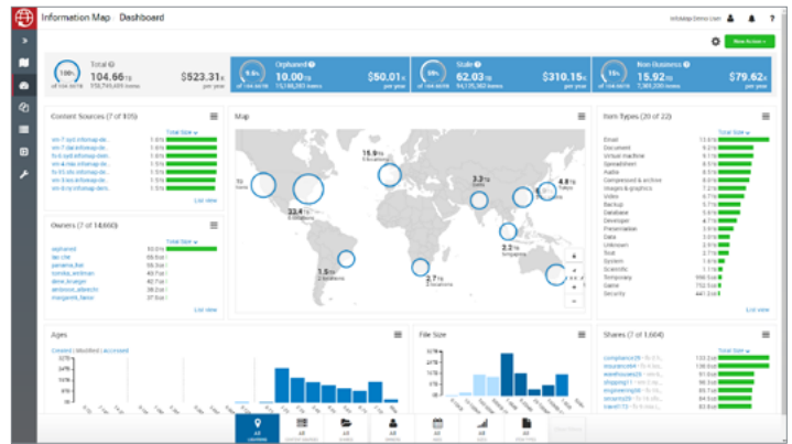
Figure 2. Veritas Information Map integration renders your information environment in visual context and guides users towards unbiased, information-governance decision making.

Backup Exec's integration with Veritas™ Information Map renders your information environment in visual context and guides users towards unbiased, information-governance decision making. Using the Information Map's dynamic navigation, customers can identify areas of risk, areas of value and areas of waste across their storage environment and make decisions which help reduce information risk and optimize information storage.